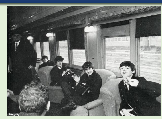
The Beattles on a train to Washington D.C. – February 1964

The address for TWMRC is 6808 Forest Hill Drive, Forest Hill, Texas 76140.